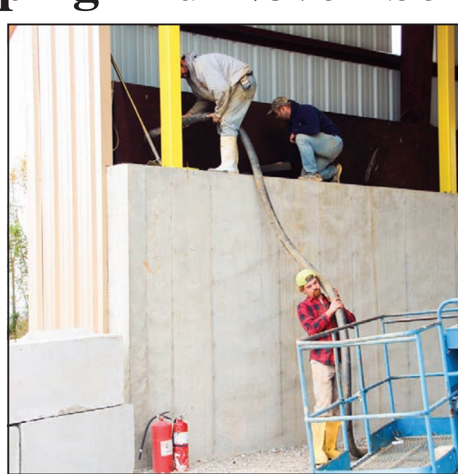
Workers pumping concrete into the new walls erected inside the commercial dumping shed at the Transfer Station last