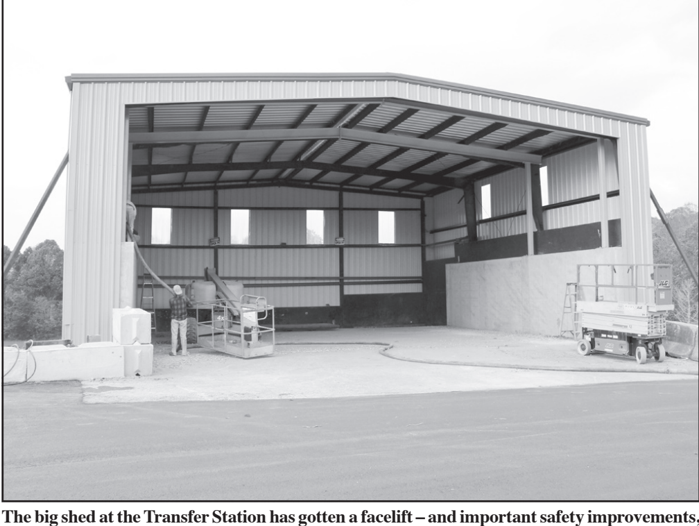
too – in preparation for re-opening later this month.

Like the Convenience Center at Georgia 325 and the