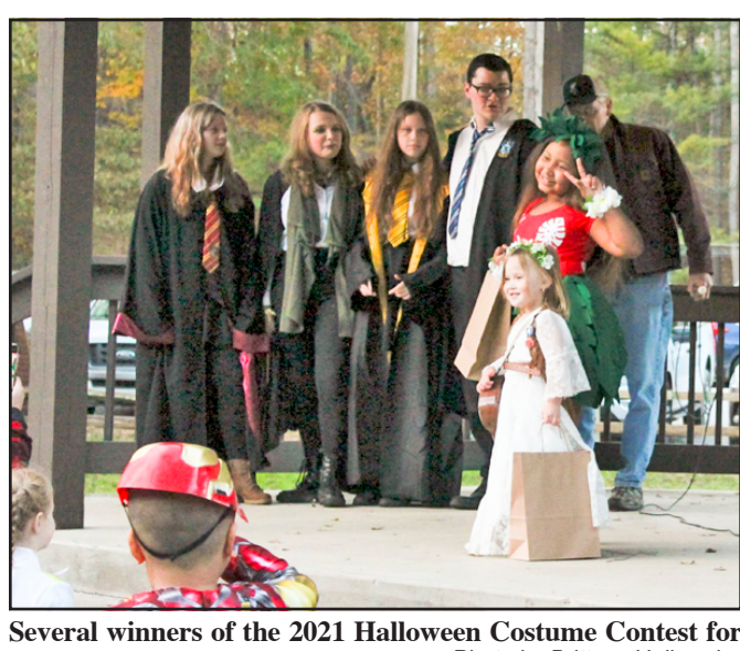
kids at Meeks Park Oct. 31.

The heavy carpet of dead leaves and the smell of loam lent themselves well to the setting as costumed youths ducked in and out of the trees, passersby with their outdoor