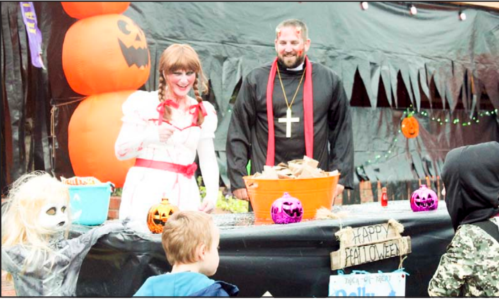
The Doucettes had a great time hosting costumed children for their now-annual Halloween at Nottely Marina.

decorations like pumpkins and bodies. Further up the property, a skeleton crew with glowing eyes and tattered clothing stood around a gazebo decorated like a pirate ship.