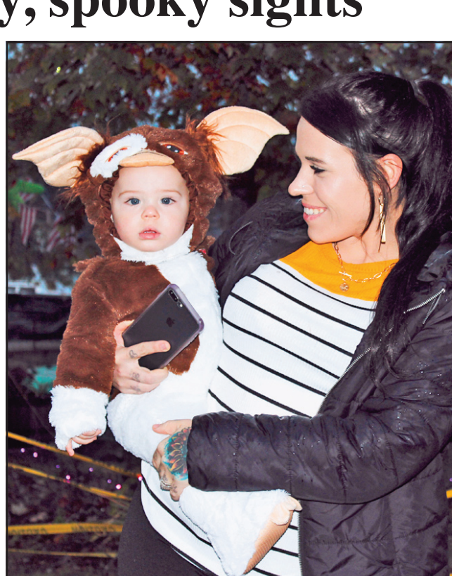
Mogwai from "Gremlins" attended Halloween at Nottely Marina over the weekend.

Inflatable lawn See Marina Halloween, Page 6A